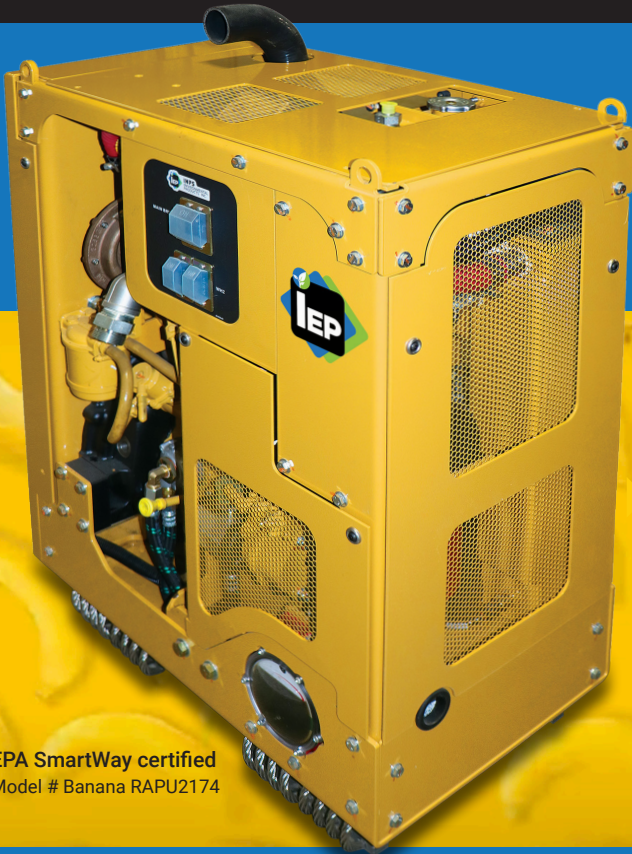
EPA SmartWay certified Model # Banana RAPU2174

SAVE on fuel without sacrificing crew comfort!